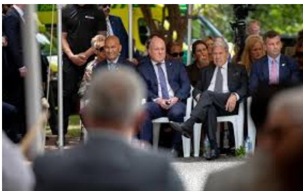
Prime Minister Christopher Luxon at Waitangi.

“The alternative rules-based order could be crafted to open political spaces for substantive participation by Indigenous peoples as peoples of inherent agency. They could participate as shareholders in public authority, not as stakeholders to be consulted in someone else’s project.” — Dominic O’Sullivan. - Read more