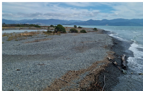
Wairau Bar.

A Marlborough iwi now has responsibility for managing a historic coastal site including the area of the first Polynesian settlement in Aotearoa. - Read more