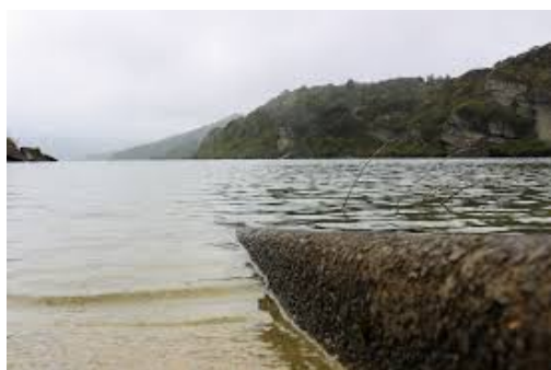
Ngāti Ruapani Mai Waikaremoana

Programme and registration on this link :