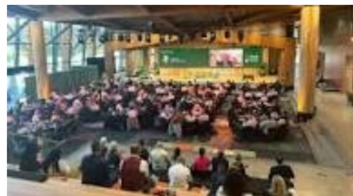
Summit delegates meet inside Te Pā at Waikato

Māori Queen Te Arikinui Kuini Nga wai hono i te po has launched the 'Kotahitanga Fund', a new multi-million-dollar Māori investment platform. ... In her closing address, Te Arikinui said she was proud to launch the initiative as a "declaration" that Māori were ready to invest in "ourselves, in our