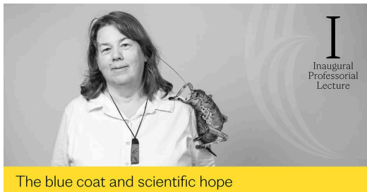
The blue coat and scientific hope